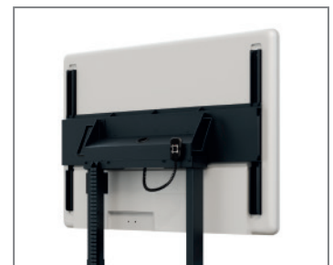
Hole pattern display-specific optimised